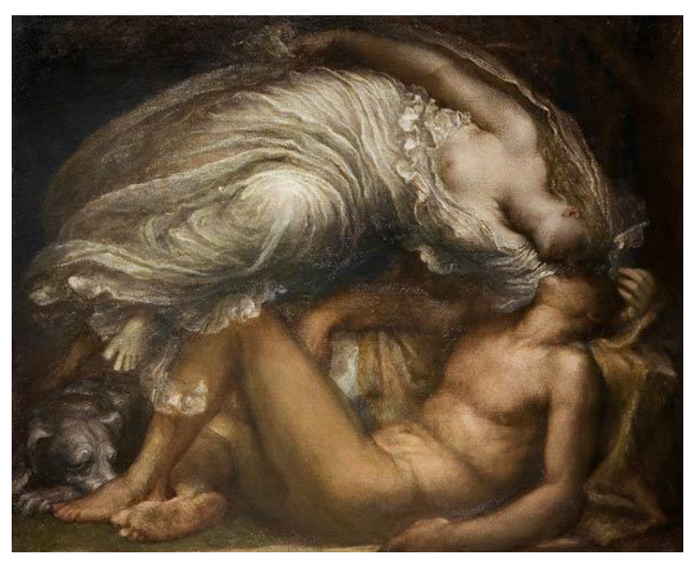
Endimion and Selene de Watts (dog with eyes open)

The Moon is the mother of fate and is known by a multiplicity of names, but it is rare to find a goddess in some Greek, Celtic or Mesoamerican pantheon that does not possess a lunar appearance or manifestation, but it is difficult to find a Lunar Goddess who possesses all the symbolic characteristics. The Moon is the mother of fate and Maya means illusion and comes from the verbal root "ma", measure, conform, form, build, create, show or expose.